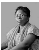
Akpezi Ogbuigwe (Nigeria) Head Education and Training UNEP Nairobi